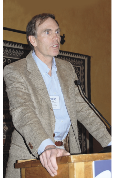
Brad Udall, director of the Western Water Assessment's Climate Diagnostics Center

Subtle atmospheric alterations can have profound hydrologic impacts, particularly in regions where efforts are geared toward preserving and restoring endangered plants and wildlife. In the upper reaches of the Colorado River, warmer water temperatures for a longer period of the time are not beneficial to native trout nor the aquatic ecosystem that supports them.