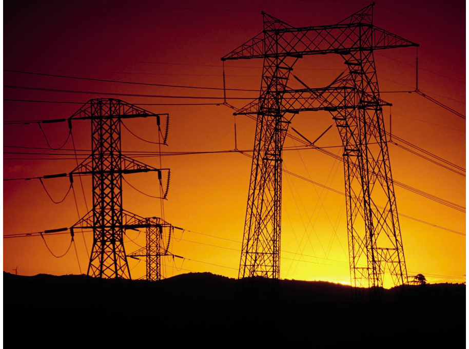
Another impact of climate change could be a reduction in energy production.

Record springtime temperatures in the Upper Colorado Basin and the hotter-than-usual June to September in Phoenix (which recorded nearly 50 days of temperatures at 109° F or greater) are signals of a changing climate and not part of the normal trend of variation, according to Udall. “When this drought started it was easy to believe that ‘Hey, this is just a historical norm drought, we’ve seen these before,’ but what is increasingly clear is that this is a drought