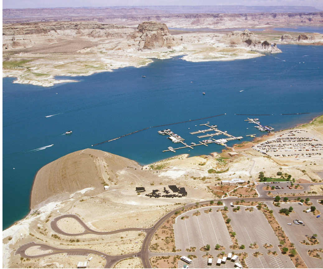
Drought has reduced water storage in Lake Powell by half.

Through voter-approved bond money, California DWR administers grants to local water agencies for integrated regional water management plans (IRWMPs), a process designed to promote cooperative, regional approaches to water planning and find areas of mutual benefit. IRWMPs emerged to counter the past practice by which individual water agencies pursued smaller, localized water projects – often in competition against neighboring agencies for water and grant funding. As water supplies tighten and the future becomes less certain, it is expected that IRWMPs will reflect the flexibility and diversity officials say is needed.