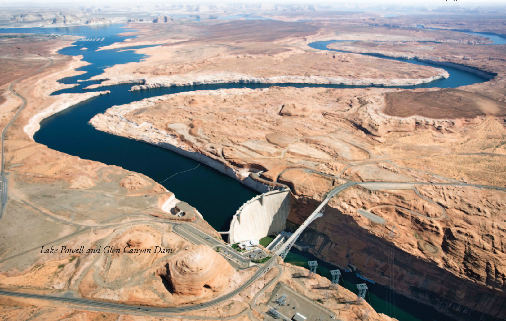
Lake Powell and Glen Canyon Dam