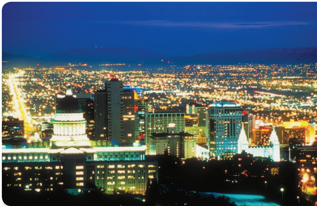
Glen Canyon Dam is an important source of electricity in the Southwest. Above, Salt Lake City.

In 1996, 2004 and 2008, scientists conducted one weeklong and 2-1/2 days of steady flows of 45,000 to 42,000 cubic