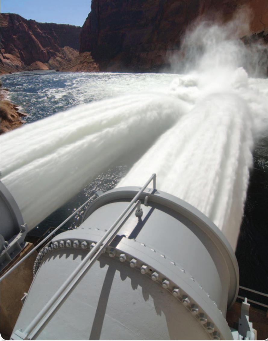
Scientists conducted high-flow, flood-like releases from Glen Canyon Dam in 1996, 2004 and 2008.

2010 paper published in the Columbia Journal of Environmental Law questioned the success of the AMP, saying it has “failed to stabilize or otherwise improve the quality of the fragile downstream ecosystem,” and “has been unable to make substantial progress toward resolving the significant resource conflicts at the heart of the Dam’s operations.”